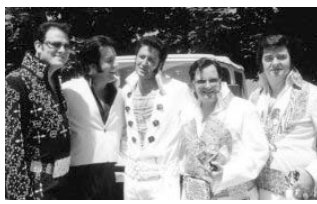
Free CD for the best 3 people dressed up as Elvis, or any other 50s legend.

For our Sock Hop on June 6 normal dance shoes will be permitted (and please, no motorcycle boots!).