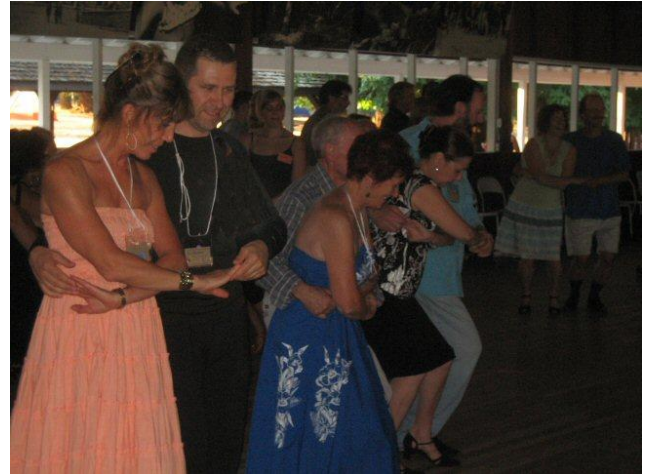
Merengue seemed natural in the Newcastle breeze