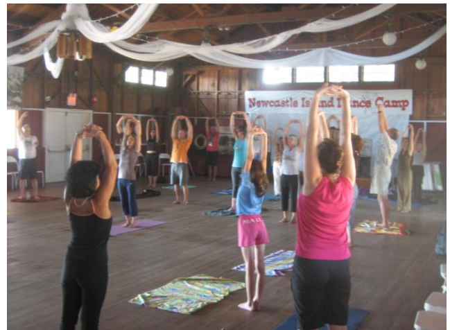
Yoga to start off the day.